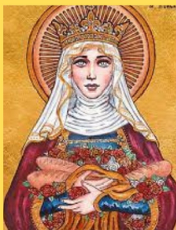
St Elizabeth of Hungary