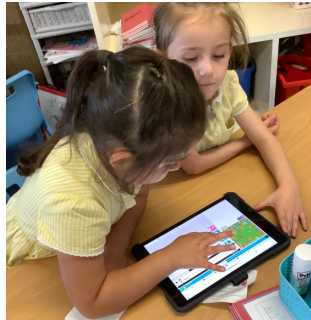
Great teamwork in Y1/2 coding!!