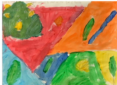
More beautiful paintings.