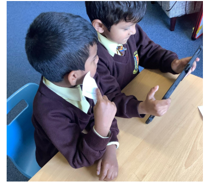
Great teamwork in Y1/2 coding!!