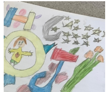
Some lovely work in RE in Y3/4 looking at the signs and symbols representing St Joseph.