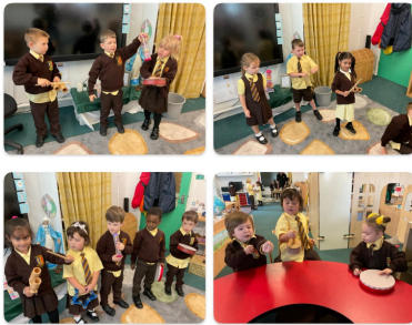
Bringing the rain to Kapiti plain- Making the sounds for the bow, rain and thunder

As always, it has been a busy week in school with lots of learning taking place. Here are some of the highlights.