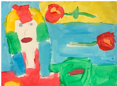
Beautiful Matisse paintings in Y3/4