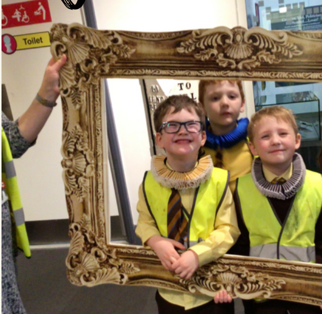
Year 1 loved their trip to the museum!