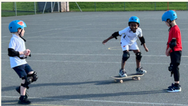
The children had a great time learning to skateboard at the Skateboarding event at Longfield.